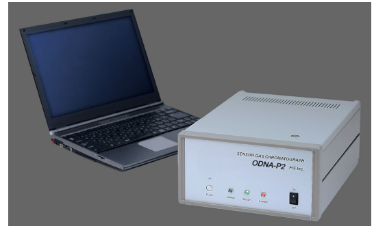
PC is not included.