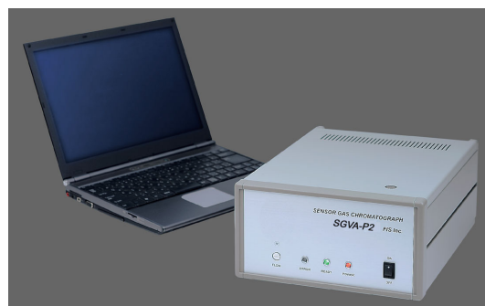
PC is not included.